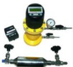
Portable/Laboratory Density meter LNG