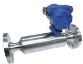
In-flow Density and Viscosity Meters DC-52 SERIES