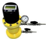
Portable/Laboratory Density meter LPG