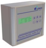
Low Flow Rate Density Meter DC-30 SERIES