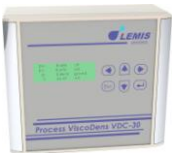
Low Flow Rate Density & Viscosity Meter VDC-30 SERIES