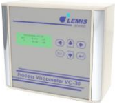
Low Flow Rate Viscometer VC-30 SERIES