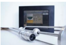
Process Density and Level Gauge DLG-400