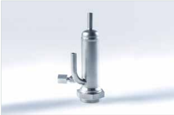
Flow adapter for refrigerant applications

For an easy integration of the sensor into the process, the flow adapter is ideal and available in various designs. The inlet and outlet are a standard tube with 12 mm diameter (OD), which can be assembled with suitable fittings. In addition, the adapter provides the integration of a pressure sensor.