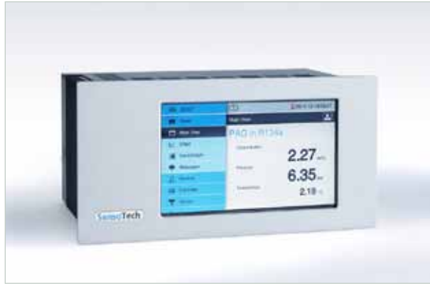
LiquiSonic® controller 30

The controller power supply is 100 - 240 V AC, 50 - 60 Hz. Optionally, 24 V DC (10 - 32 V DC) are available, which have proved particularly for mobile use of the device.