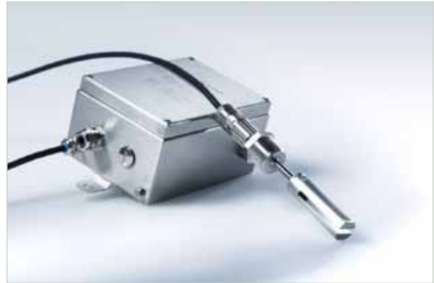
LiquiSonic® immersion sensor for oil/refrigerant mixtures

The special sensor electronics are located in a stainless steel housing, separated from the sensor and with a protection degree of IP68.