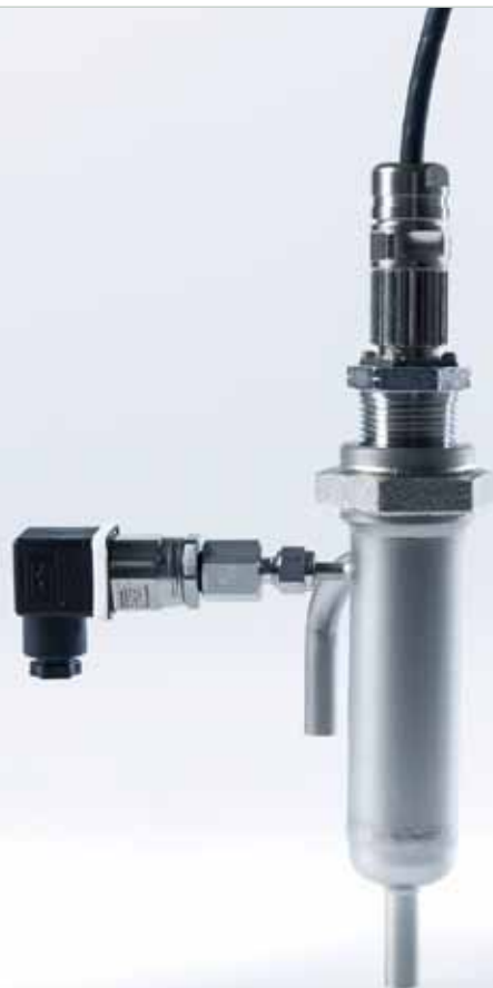
LiquiSonic® system structure - ultrasonic sensor and pressure transmitter integrated in the flow adapter