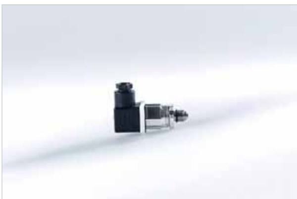
Pressure transmitter for refrigerant applications

To determine the pressure compensated concentration, the LiquiSonic® analyzer includes a pressure sensor. The pressure is fed and set off by an analog signal of 4 ... 20 mA in the controller.