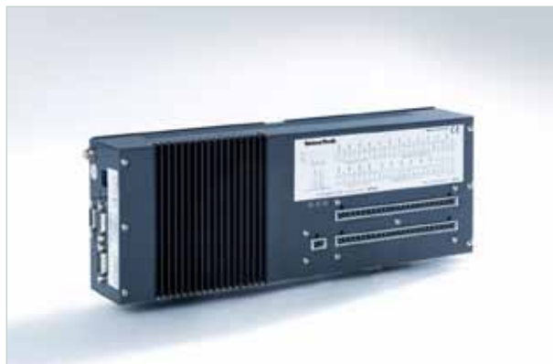
LiquiSonic® controller 5 for OEM refrigerant applications

By the space-saving construction with rail mounting, the controller 5 is designed as OEM device for the equipment of vehicles and the integration in test benches. In addition to the usual interfaces, the controller 5 includes an integration via CAN bus. The power supply is 24 V DC ( \pm 15\% ). Optionally, a large power supply with 10 - 32 V DC is available.